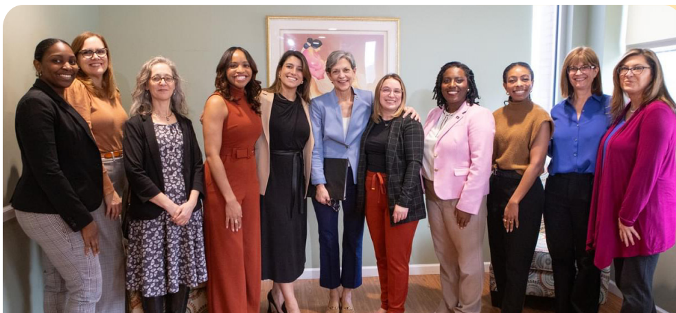
Community partners, legislators, and government officials at The Midwife Center on International Women's Day, March 8, 2024.